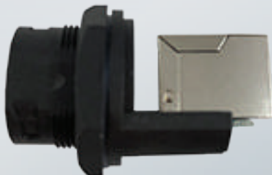
■ RJ45 Panel Mount Coupler

The CRPB-818 Remote Trigger can be plugged directly into the BUS-012 or Core Hub. If your hub is in a difficult to reach location, you can use a 13/16" drill bit or a d-punch to create a mounting hole on the side of your console to allow for easier plug and play. Simply connect your coupler to your hub with a Cat5 cable.